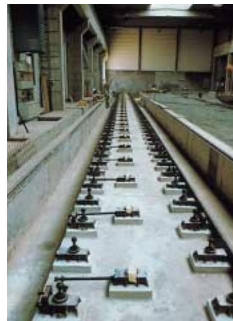
BW-Fixator® with PAGEL-V1®